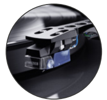
WITH CARTRIDGE AUDIO-TECHNICA VM520EB