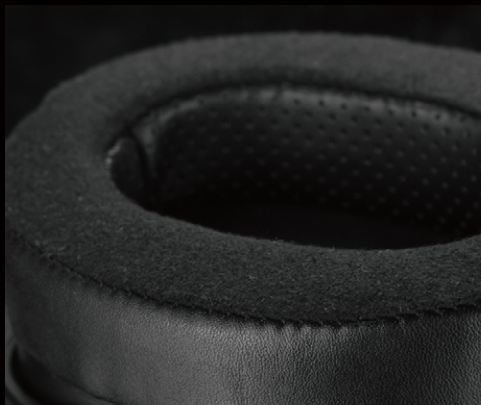
Synthetic Leather With Flannel Wrapping Ear Cushion

QUAD audio components combine the assurance of tradition with the excitement of innovation, and the ERA-1 headphones are a perfect example. Robust construction and a premium finish deliver a suitably luxurious feel, yet the headphones are comfortably lightweight compared to many planar magnetic designs. A choice of two ear cushions are provided – one made of soft leather, the other fashioned from latex with a soft, fleecy layer in contact with your ear. A high-quality, detachable 215cm cable is also supplied, together with a durable carrying case.