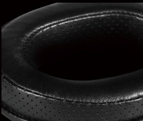
Genuine Sheep Skin Ear Cushion